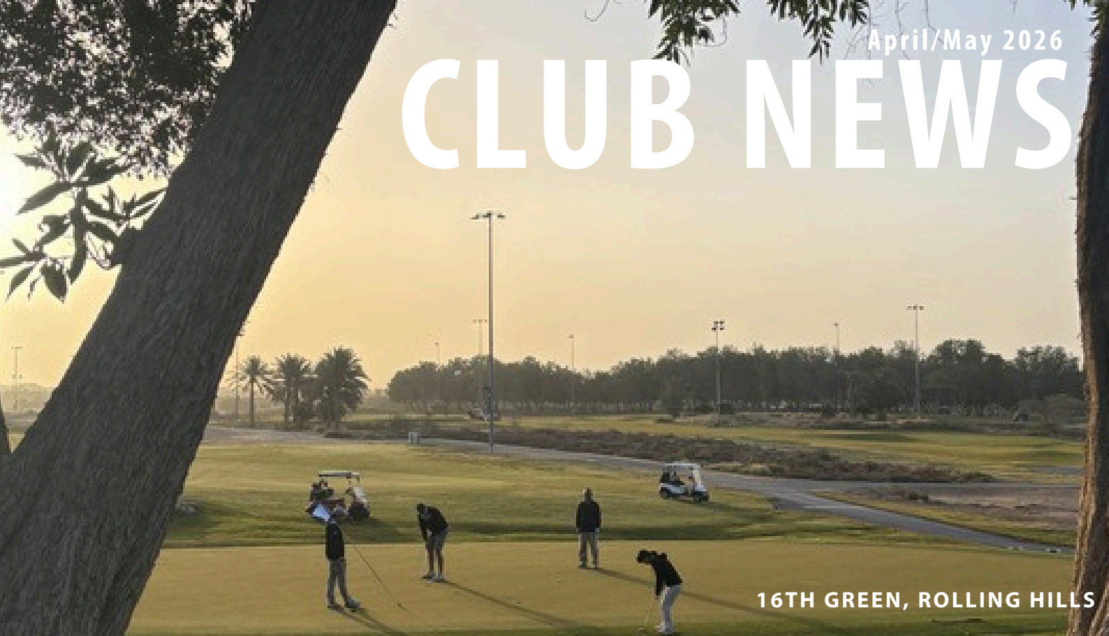
16TH GREEN, ROLLING HILLS