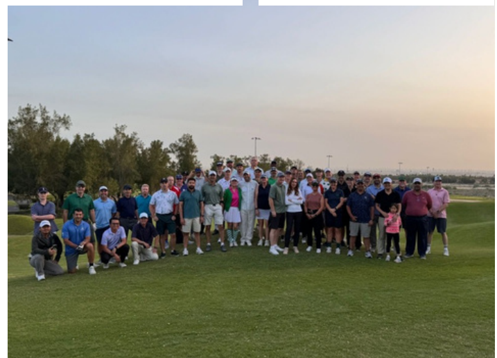
Masters Par 3 Social