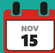
Nine & Dine evening event