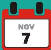
Tue AM Skills with Stuart