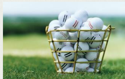
Golfers can now use range balls on the putting green/chipping area

Remember, in order to play in the Opening Day Tournament you need to make sure you have paid your membership fees for 2022.