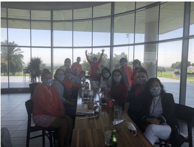
Ladies from TMLL after our Year End Fun Tournament.